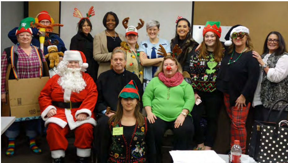
2018 Mock Trial Cast