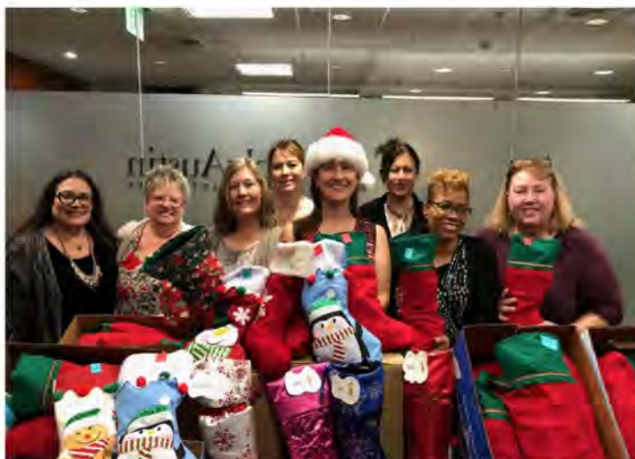
-The Stocking Stuffer Squad 2018-